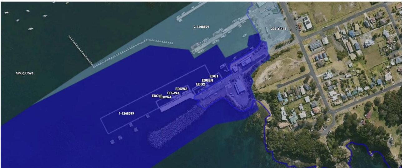
Figure 1-1 Lot boundaries and Berths at Eden Cruise Ship Facility

The Facility is located within Lot 1 DP1268599, as shown in Figure 1-1. The Facility is at the end of Weecoon Street, Snug Cove, on the northern side of Twofold Bay, within the Port of Eden, Bega Valley Shire Local Government Area (LGA), approximately 40km north of the New South Wales and Victorian border. The Facility is shown in Figure 1-2 and Figure 1-3.