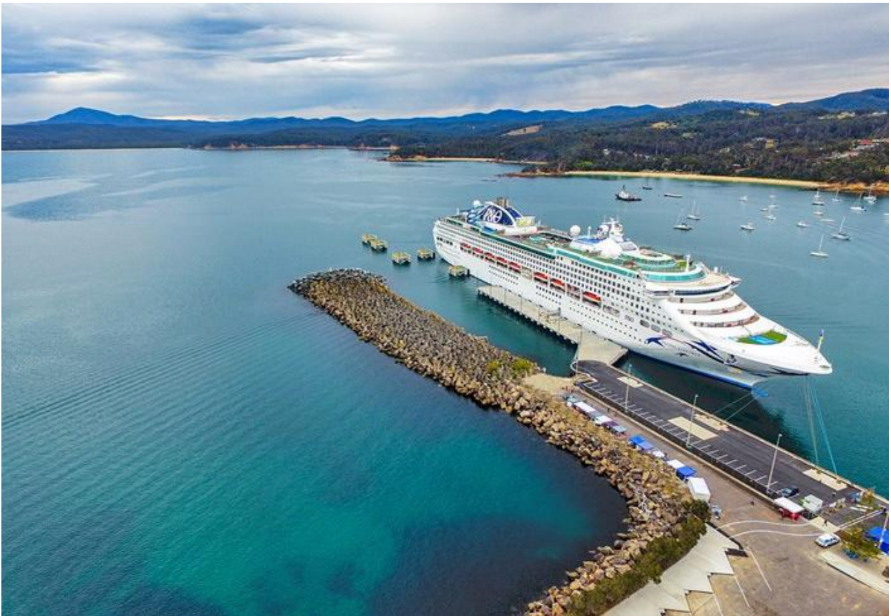
Figure 1-3 The Pacific Explorer Cruise ship at the Facility

The Facility comprises the Eden Breakwater Wharf and the Wharf Extension (the Wharf), and all associated infrastructure required to allow cruise ships to berth and land side areas, facilities and services for management of passenger visitation including day visit disembarkation, embarkation and transport. Key elements of the Facility include: