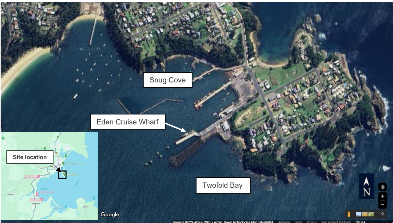
Figure 1-2 Eden Cruise Facility within its context in Snug Cove, Eden